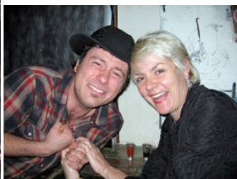
With Chef Chuck Hughes at Garde Manger.