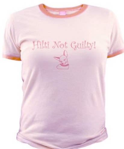
Tinkerbell has rights too you know!

Since we are living and breathing within the creative community, ideas and slogans come to us all the time. So, starting this month we will present unique logos and prints. Whether you like or hate Paris Hilton we thought you can make a fashion statement by supporting the heiress' ordeal in jail! We have other unique designs waiting for you in the store. We'll just keep adding them. Stay tuned to this section.