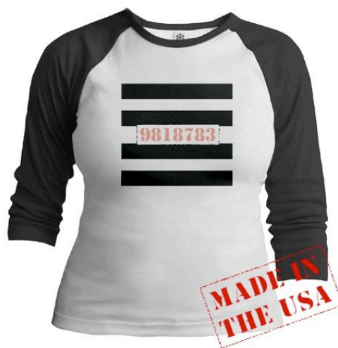
Paris' Prisoner Identification Number