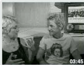
REO Kevin Cronin Interview