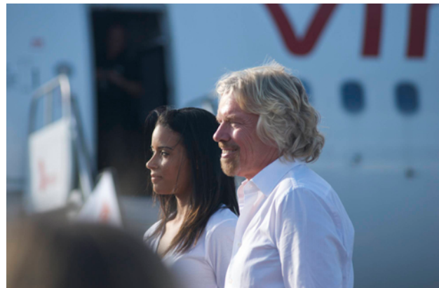
Sir Richard Branson